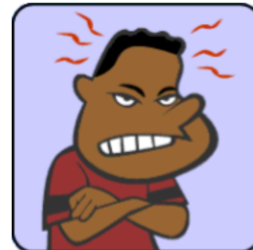
All About Anger