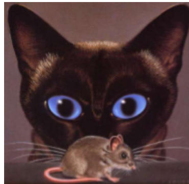
Here Comes the Cat