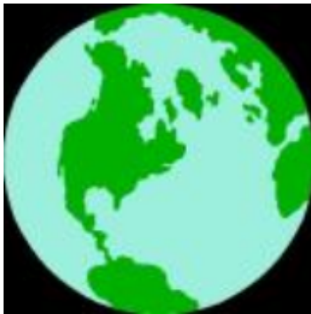
Earth: A First Look